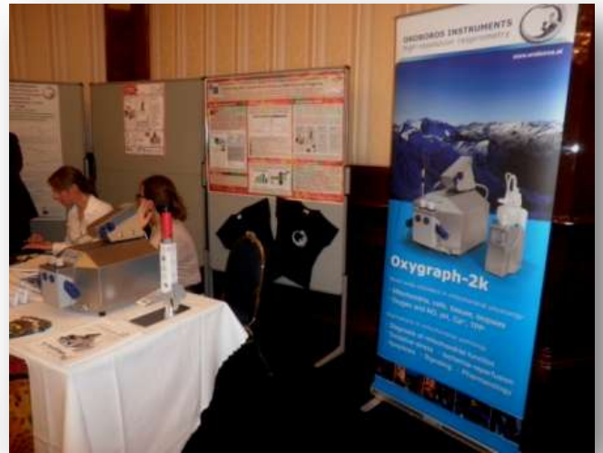
Oroboros Instruments Stand