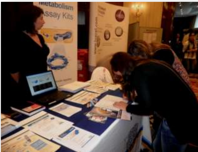
Abcam and Luxcel Stands