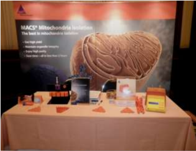
Macs Miltenyi Biotec Stand

Almost of our supporters had a stand in order to present their last innovations, equipment or results to all of our attendees. They also had the opportunity to meet and discuss with their competitor and partners during those 2 days of conference.